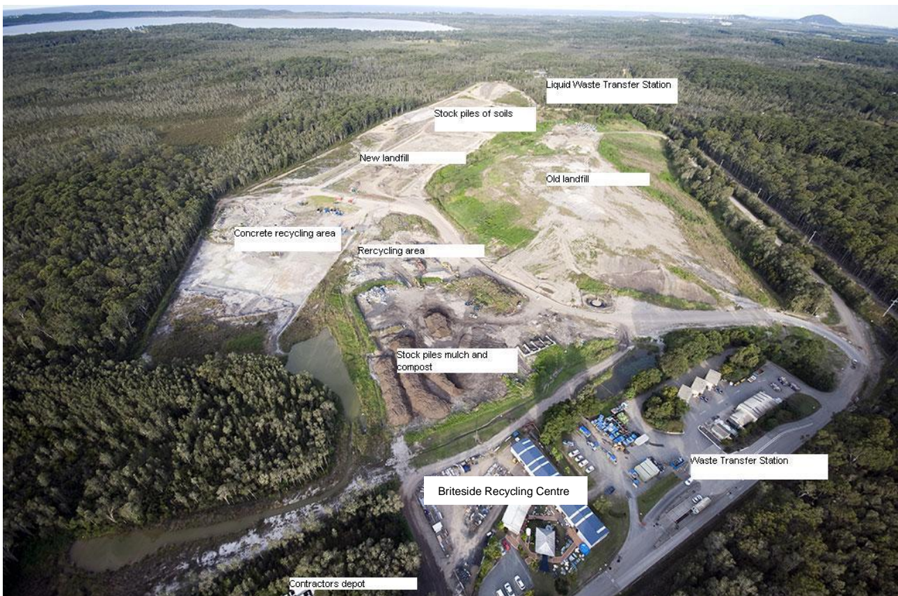
Fig 2: Eumundi-Noosa Road Resource Recovery and Landfill Facility.

Municipal waste disposal at the Noosa Landfill and Resource Recovery Facility is authorised under the Queensland Environmental Protection Act via a 60 (1a) Environmental Authority with approval number EPPR01855314. The Environmental Authority has conditioned that releases of surface and groundwater must be managed from the site in accordance with a site specific Receiving Environmental Monitoring Program (REMP). The intent of the REMP is to provide an early alert for investigation into any waste water discharges and provide sufficient time for suitable actions to be implemented to prevent environmental harm. Noosa Council has sought to implement a REMP that is more responsive to site specific downstream environment values. Noosa Council underwent a series of negotiations from 2013 to the present to update the existing Environment Authority for the Landfill to reflect the more modern conditions applied under REMP. Noosa Council has commenced monitoring pursuant to the site specific REMP in late 2015.