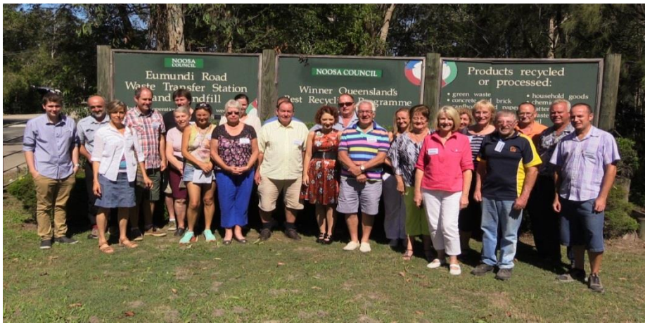
Fig 14: Community Jury Members at the Eumundi-Noosa Rd Resource Recovery Facility

In early 2015, 24 jurors were selected from 3,000 residents on the electoral roll representing a cross section of Noosa’s diverse community. The Jury met once a month over six months to reach agreement and prepare a verdict on ways to minimise organic waste to landfill. The group toured the Eumundi-Noosa road landfill, reviewed 30 submissions and heard presentations from community representatives, industry spokespeople and experts in the field of waste management.