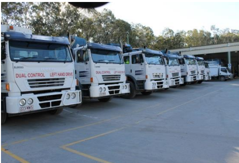
Fig 6: Waste Collection

Noosa Council's Waste Management Service (WMS) is responsible for the delivery of high standard domestic and commercial waste and recycling collection systems for Noosa residents and businesses.