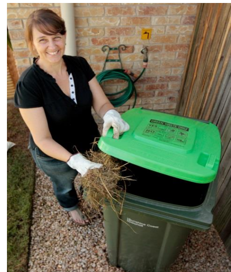
Fig 7: Garden Waste Bin

A 240 litre fortnightly voluntary garden waste service is provided at $65/year (fee valid as of February 2016). In January 2015 there were 3426 services and by December 2015 there were 3975. The popular service has experienced a growth of 16% in service numbers from January to December 2015. The garden waste bin is collected fortnightly on the alternate week to the recycling bin service day. The garden waste bin accepts grass, weeds, offcuts and small branches (no food). In line with one of the recommendations from the Community Jury (refer to Section 10 Table 7 Community Jury Recommendations) , it is proposed to make the garden waste service compulsory to residents in urban areas from the commencement of the new waste contract in 2017.