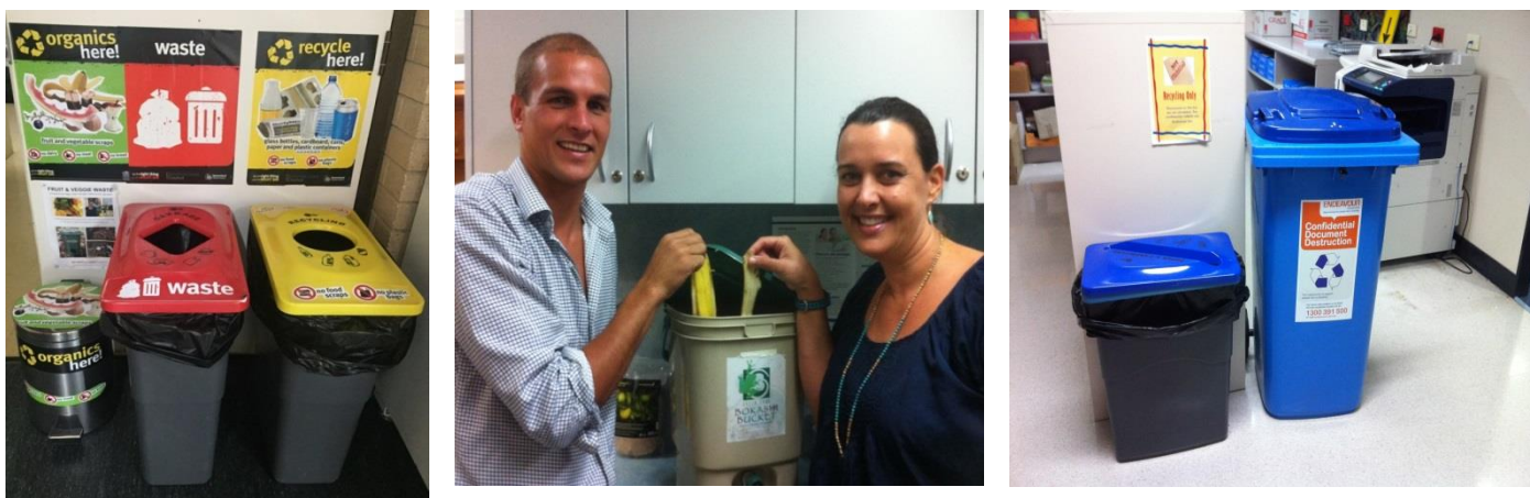
Fig 5: Council Staff Recycling & Composting

In 2014/15 Council activities generated 1483.04m 3 of waste of which 446.48m 3 were diverted from landfill which equates to a 30% diversion rate.