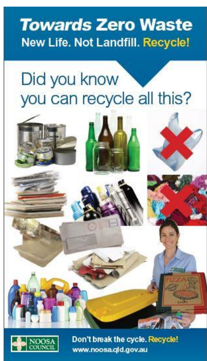
Fig 13: Towards Zero Waste Education Campaign

EnviroCom delivered educational services in local schools as well as field excursions to the Nambour waste resource management education centre and composting workshops at Bunnings, Council libraries and other Council facilities.