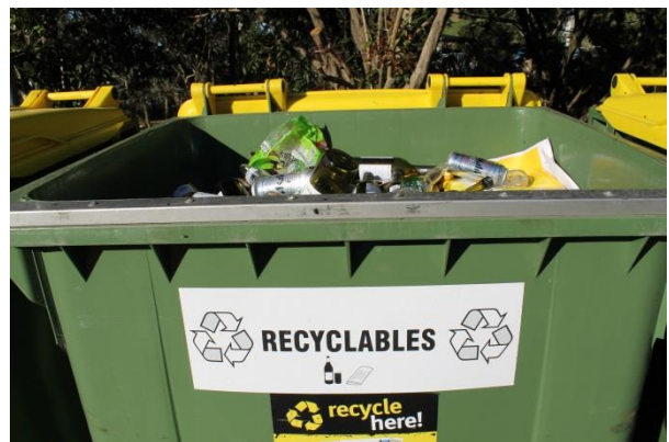
Fig 9: Low Noise 1,100 litre Recycling Bin

Commercial recycling bins are collected fortnightly, or where conveniently located (coastal area), a weekly service can be provided. To encourage segregation of recyclables occupiers are entitled to an equivalent recycling volume to the waste volume with no increase in waste charges.