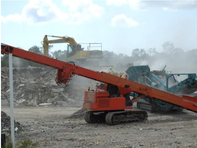
Fig 11 Concrete Crusher

The Resource Recovery Pad at the Eumundi Road Resource Recovery Centre receives waste from commercial and industrial operators, skip operators, contractors and large trailer loads of self-hauled domestic waste. The waste is sorted and items such as steel, concrete and green waste are recovered and recycled.