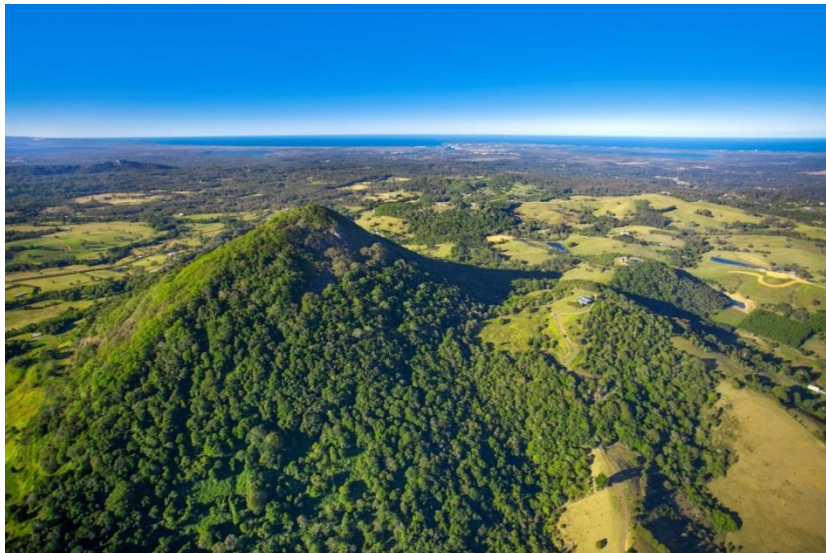
Fig 1: Noosa Hinterland, Paul Smith

Council aims to lead by example as well as educate the wider community to reduce waste sent to landfill and increase resource recovery.