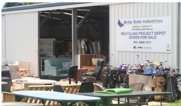
Fig 10: Briteside 'Tip Top Shop'

The "Tip Top Shop" also provides valuable training to skill unemployed people in carpentry, waste management, retail, and forklift driving.