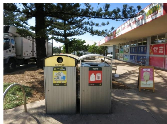
Fig 8: Public Place Recycling - Peregian Beach

In addition Council has approximately 70 dog waste dispensers across the Shire. Investigations are underway to use compostable bags in the dog waste dispensers.